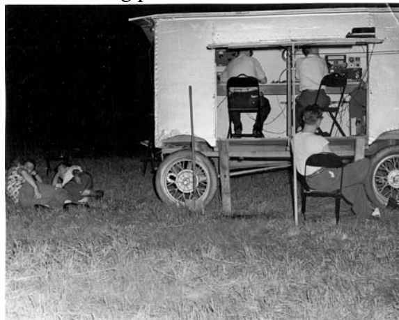
LRTS Gypsy Wagon Field Operations Unit